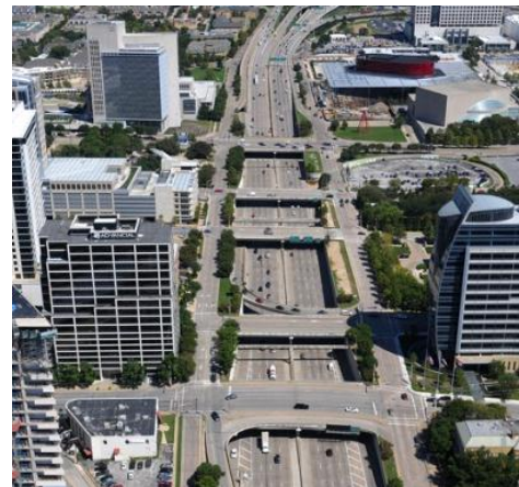
October 1, 2009

Grand opening activities for all age groups are designed to showcase the Park’s personality, as well as the programming that will be available year-round. Organizers expect a crowd of 40,000 visitors throughout the weekend to enjoy family-friendly activities such as concerts, nature classes, storytelling, live music, opera, ballet, yoga, Zumba, croquet, dog training demonstrations, chess matches, live painting, knitting lessons, dance and art classes, architecture tours, and more. A full schedule can be found at www.klydewarrenpark.org .